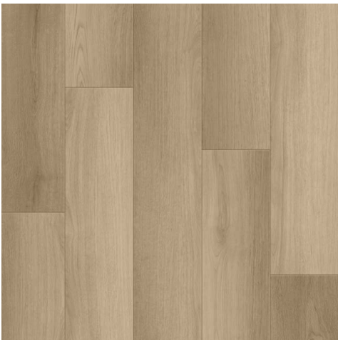
Matching Accessories Available