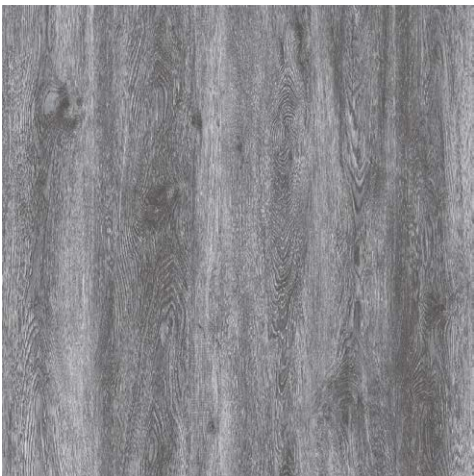
Matching Accessories Available