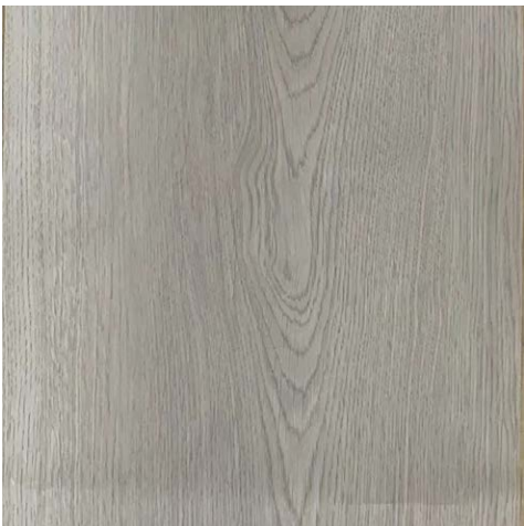
Matching Accessories Available