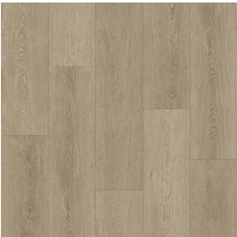
Matching Accessories Available