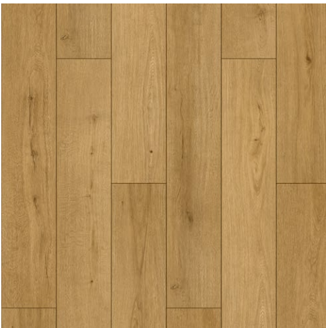
Matching Accessories Available