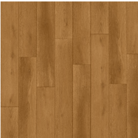
Matching Accessories Available